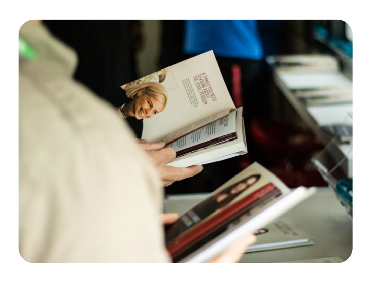
If the value of your pension is nearing the Lifetime Allowance

However, you can usually access small pots without triggering the MPAA.